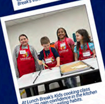
At Lunch Break's Kids cooking class students gain confidence in the kitchen and learn healthy eating habits.