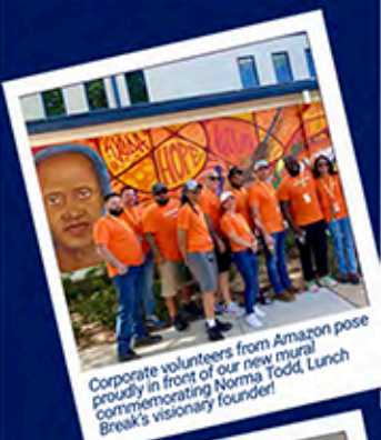
Corporate volunteers from Amazon pose proudly in front of our new mural commemorating Norma Todd, Lunch Break's visionary founder!

We serve everyone with compassion and dignity.