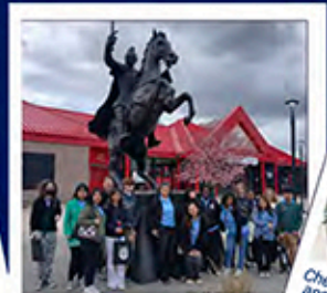
High School students explore Rutgers University, gaining insight into college life and future opportunities, as part of the Alliance for Success Program!