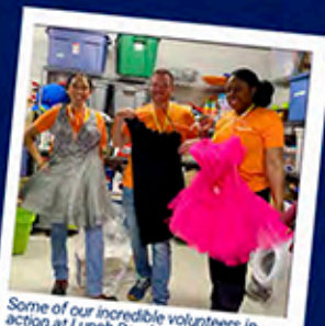
Some of our incredible volunteers in action at Lunch Break's Prom Giveaway, helping dreams come true, one dress or suit at a time.